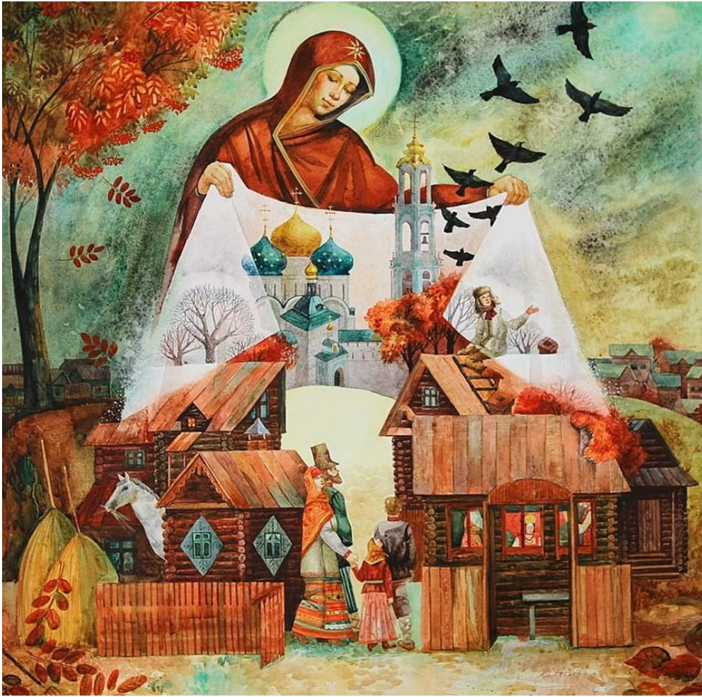
Our Lady, the Protector of Ukraine

"I'm mindful of what St. Paul said in Romans, when he said, 'The Spirit helps us in our weakness, because we don't know how to pray as we are, and sometimes the Spirit intercedes for us, with sighs too deep for words.